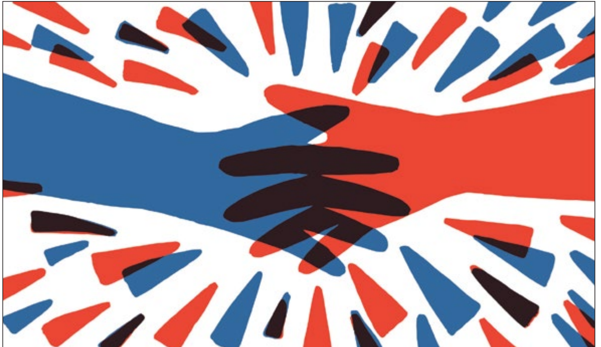
→ Figure 1. Dialogue has its roots in consent, 2020. © Gracie Dahl

for James and about the type of person he was affected me deeply, and reinforced my determination to make something of myself and to do everything I could to prevent others going through the kind of trauma they'd gone through.