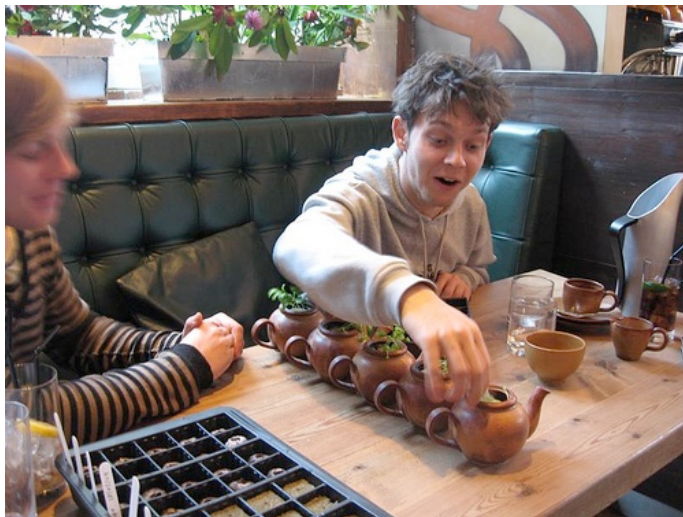
Figure 3. Fifteen grow-kit workshop, hydroponic teapots