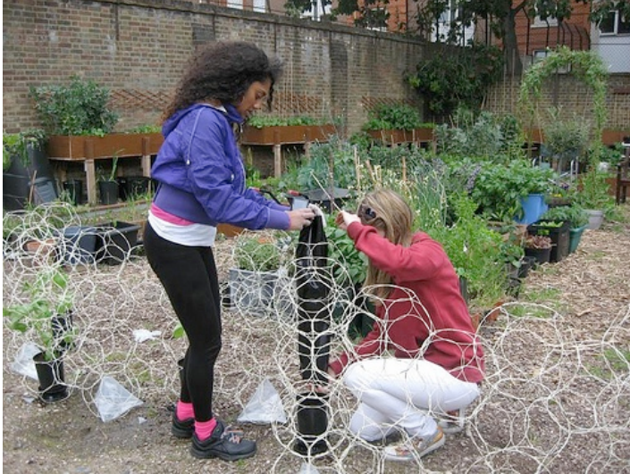
Figure 5. St.Luke's grow-kit workshop, installing a vertical structure in the allotment site