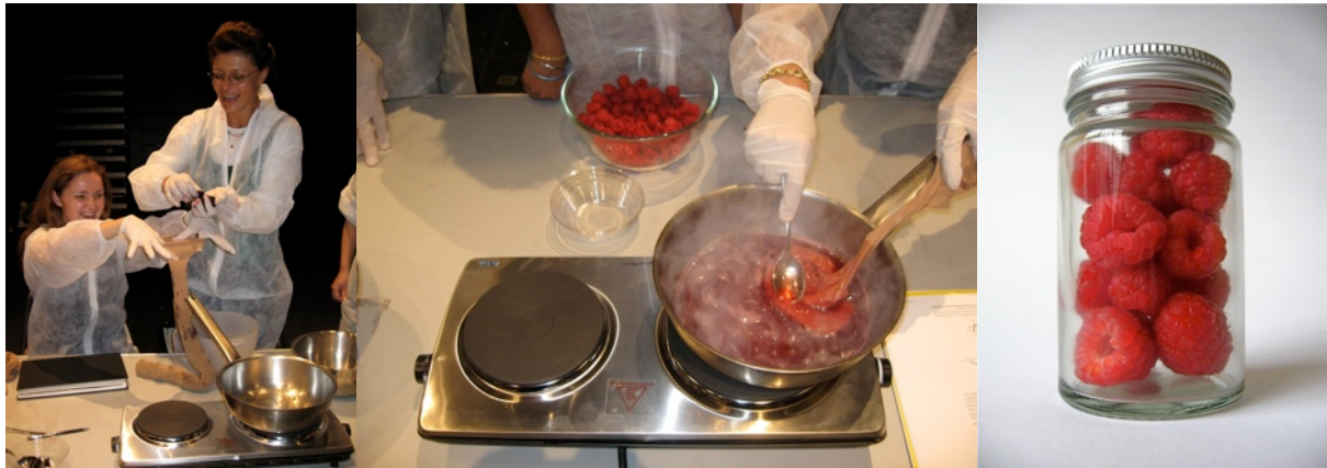
Image above from participatory design workshop at ICA 2009