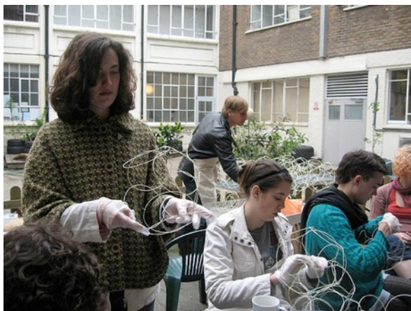
Figure 4. Byam Shaw grow-kit workshop, students weaving a vertical structure