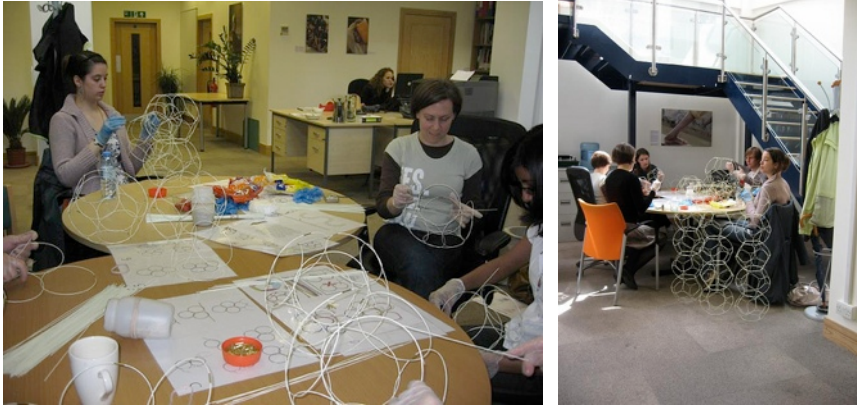
Figure 2. NFP Synergy grow-kit workshop, weaving a vertical structure